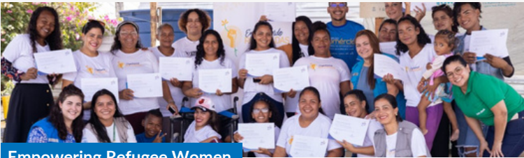
Empowering Refugee Women

In the framework of the eighth edition of Empowering Refugee Women project, UNHCR trained 111 women, with 93 of them completing the Customer Service and Sales course offered by SENAC in Boa Vista (Roraima) and Brasília (Federal District), and 18 participating in employability thematic workshops conducted by COPEL, an energy company in Curitiba (Paraná). The edition was rich in diversity. In addition to different nationalities –Venezuelan, Haitian, Cuban, Congolese, Ivorian, and Pakistani –women with disabilities, single-parent family heads, indigenous women, and LGBTQ+ individuals completed the course.