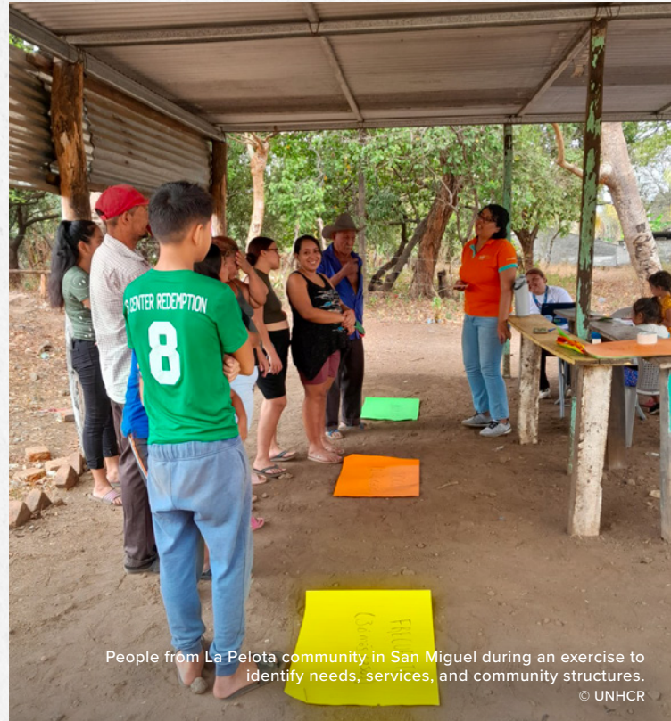
People from La Pelota community in San Miguel during an exercise to identify needs, services, and community structures.