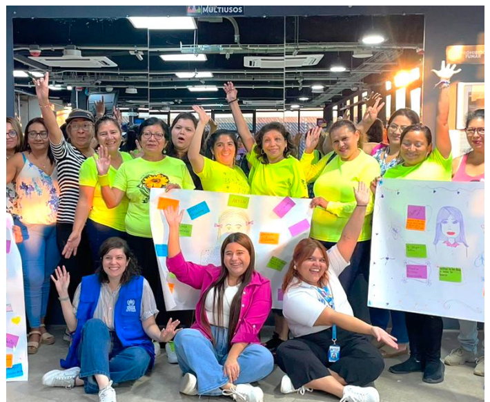
Women from different communities in Mejicanos participating in activities organized by UNHCR to commemorate International Women's Day.

● To commemorate the International Women's Day, UNHCR and World Vision organized awareness-raising sessions on the challenges and opportunities towards gender equality with 150 people in communities in Apopa, Nahuizalco, Mejicanos, Santa Ana, San Miguel, San Salvador, and Soyapango. Also, 23 women at the community centre CUBO in Santa Lucía, Mejicanos, shared opinions and analysed women's contributions to strengthening support networks.