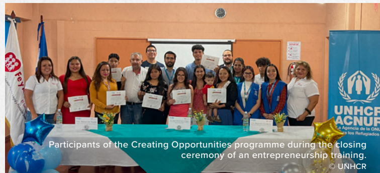
Participants of the Creating Opportunities programme during the closing ceremony of an entrepreneurship training.