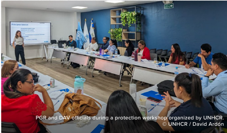
PGR and DAV officials during a protection workshop organized by UNHCR.